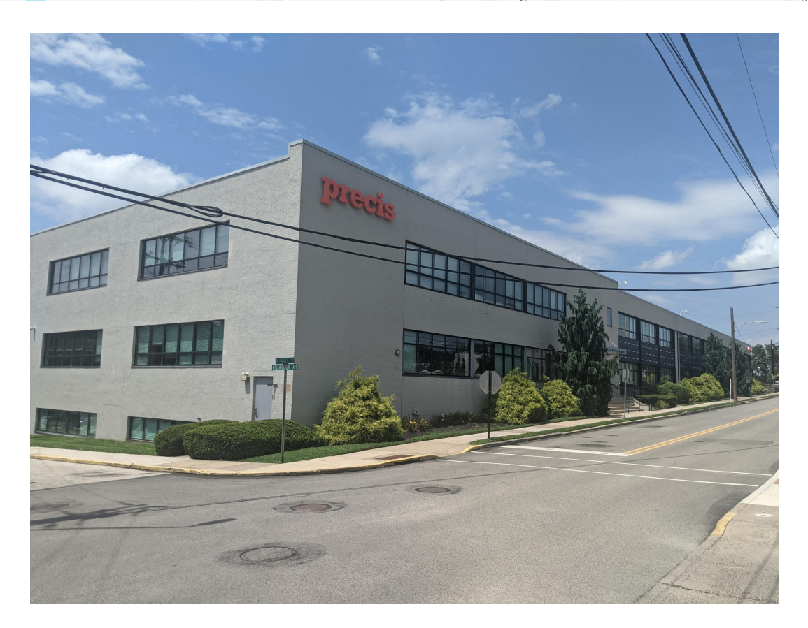
Copyright © 2023 Colliers International. Information herein has been obtained from sources deemed reliable, however its accuracy cannot be guaranteed. The user is required to conduct their own due diligence and verification.